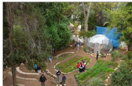
Fig. 4 Outdoor learning activities in school's ecological garden.