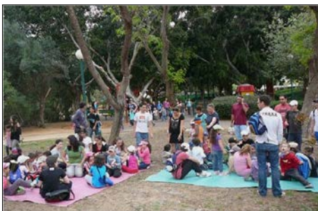
Fig. 3 Whole school learning activities in the community