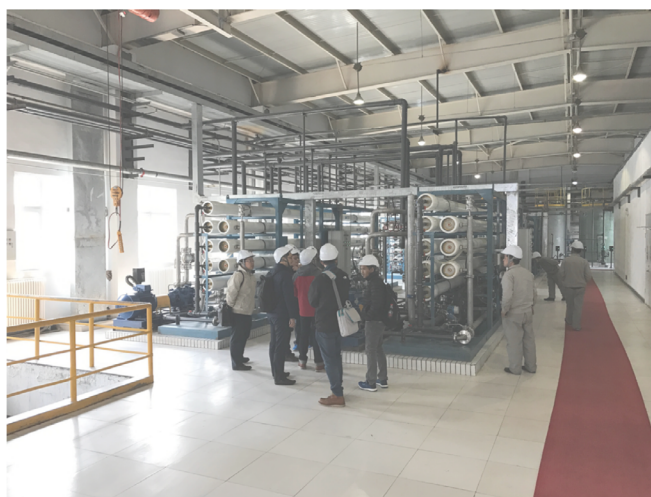
MBC System Skids at the Taihua Plant