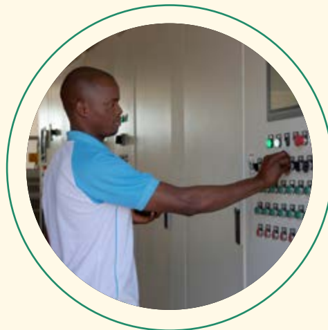
Control room of the Magula Pumping Station (Baixo Limpopo Irrigation Scheme, Gaza)

The income earned from farming has been used to improve the farmers' lives, including the payment of school fees, securing access to electricity and the installation of better latrines.