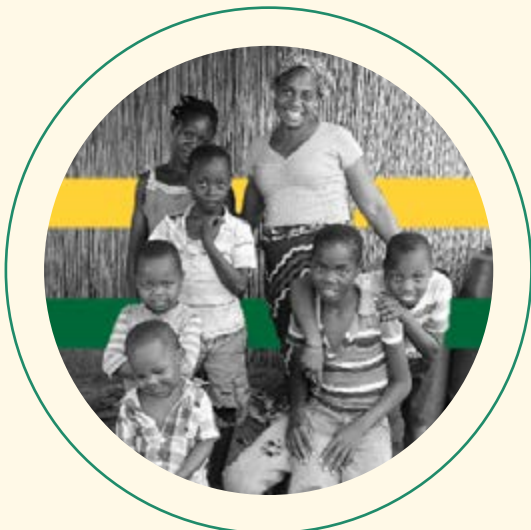
Farmer, member of the Nhancutse Agrarian Center 47 years old Mother of eight children

“My profit comes from selling my produce in the market every 15 days.”