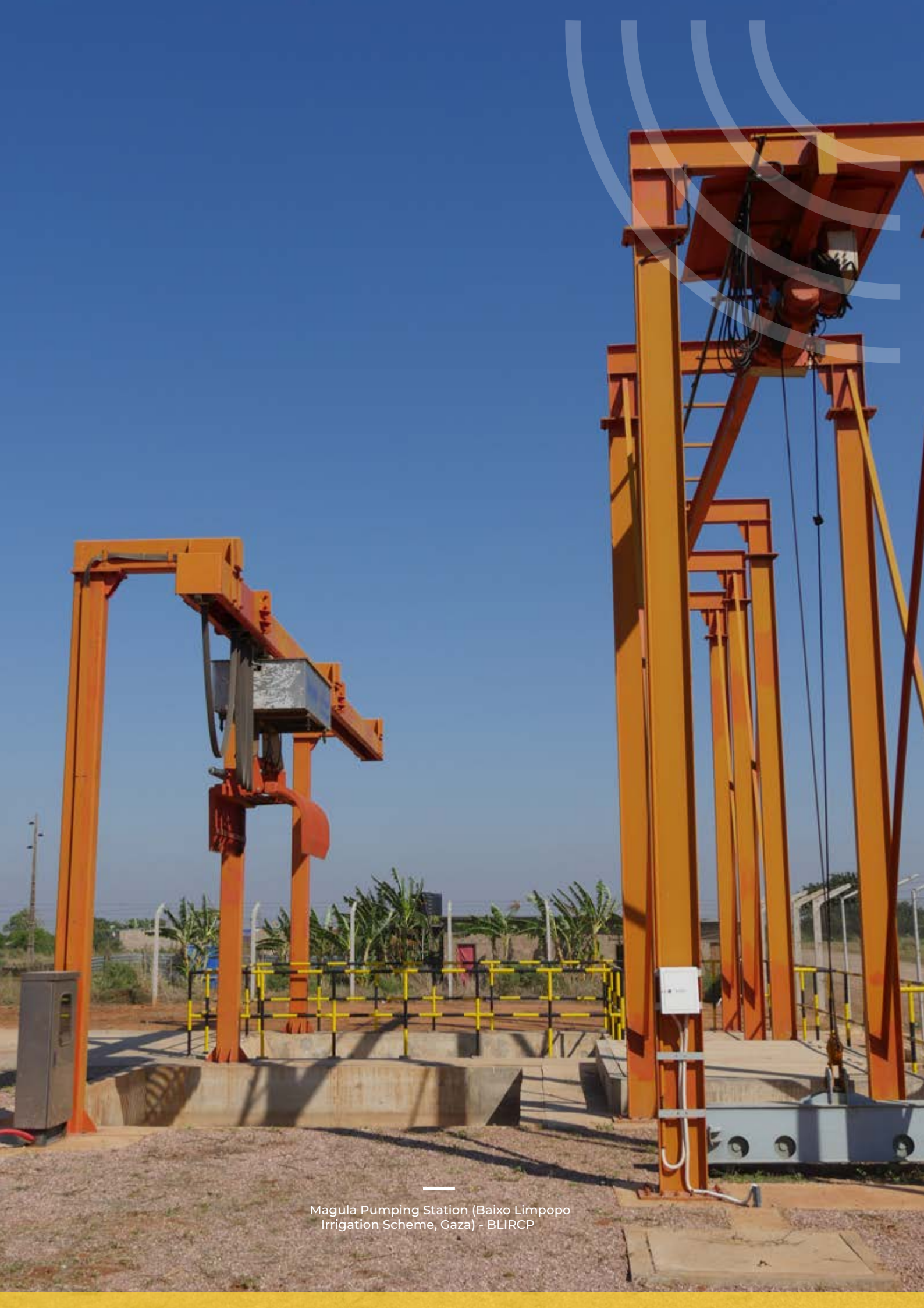
Magula Pumping Station (Baixo Limpopo Irrigation Scheme, Gaza) - BLIRCP