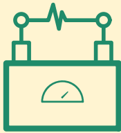
Supplied and installed a fully operational standby generator