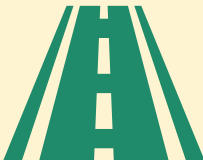
Completed the rehabilitation of 47.7km of rural roads using a climate resilient design

BLICRP achieved a number of milestones: the project completed the rehabilitation of 52 km of drainage network servicing a total area of 2,000 ha; supplied and installed a fully operational standby generator; completed the Magula Block irrigation scheme; The construction of a maternity center; and the rehabilitation of 47.7 km of rural roads using a climate-resilient design. Furthermore, during the 2017/18 planting season, 444 farmers benefited from technology transfer for rice production. Of these, 50 were emergent farmers and 213 were new producers under intensive training, including 35 young people. Lastly, BLICRP completed the construction of an agro-processing center (Limpopo Horticulture Processing Center - CEPHOL) employing 37 workers, 31 of them women.