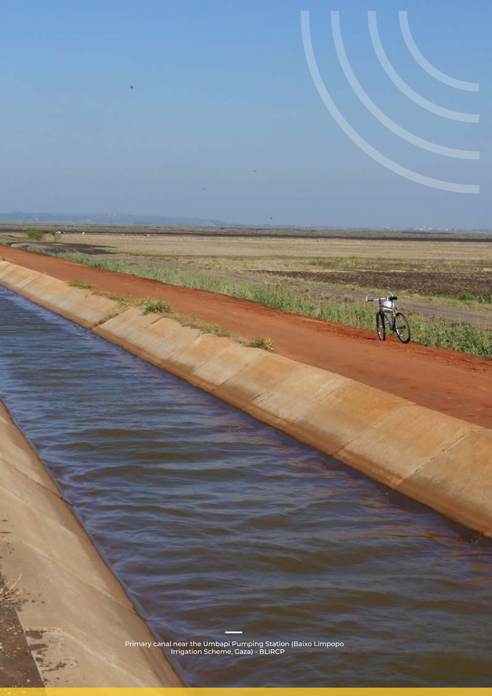
Primary canal near the Umbapi Pumping Station (Baixo Limpopo Irrigation Scheme, Gaza) - BLIRCP