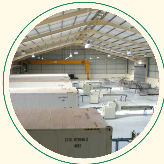
Processing Center for Vegetables and Fruits - CEPHOL (Baixo Limpopo Irrigation Scheme, Gaza) - BLIRCP