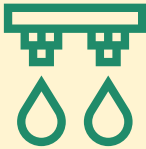
Completed the Magula block irrigation scheme covering 1,050 ha